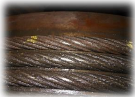
Rouge or Corrosion