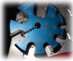
Reduction in diameter