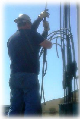
Post-installation testing to ASME Elevator Safety Code